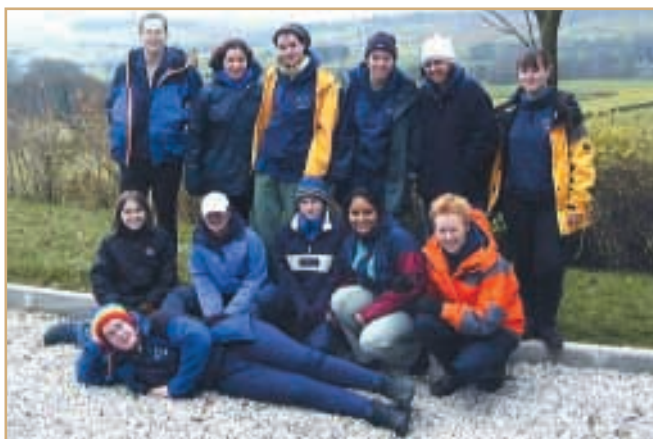
The Mongolia team on the school's first ever World Challenge Expedition.

Now the team is back, settling into examinations, but the trip will stay with them for a long time. World Challenge