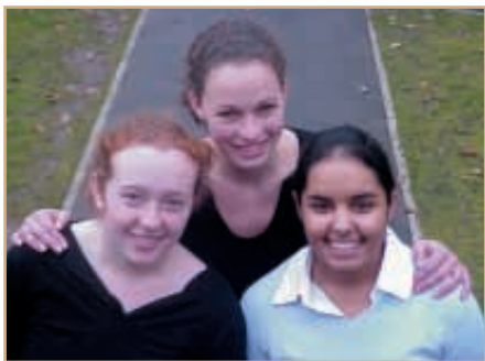
Part of the winning sixth form Bank of England Team.

So successful were they that they won this stage of the competition and now go forward to the Regional Final in February. Congratulations, financiers!