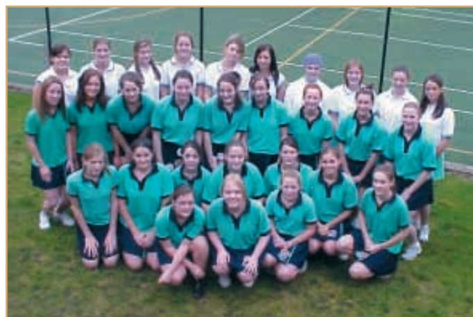
Sheffield High School netball teams.

Success against opponents of such strength is commendable, but to make it even more special, Sheffield High School neither tied nor were beaten in any individual match by any team!