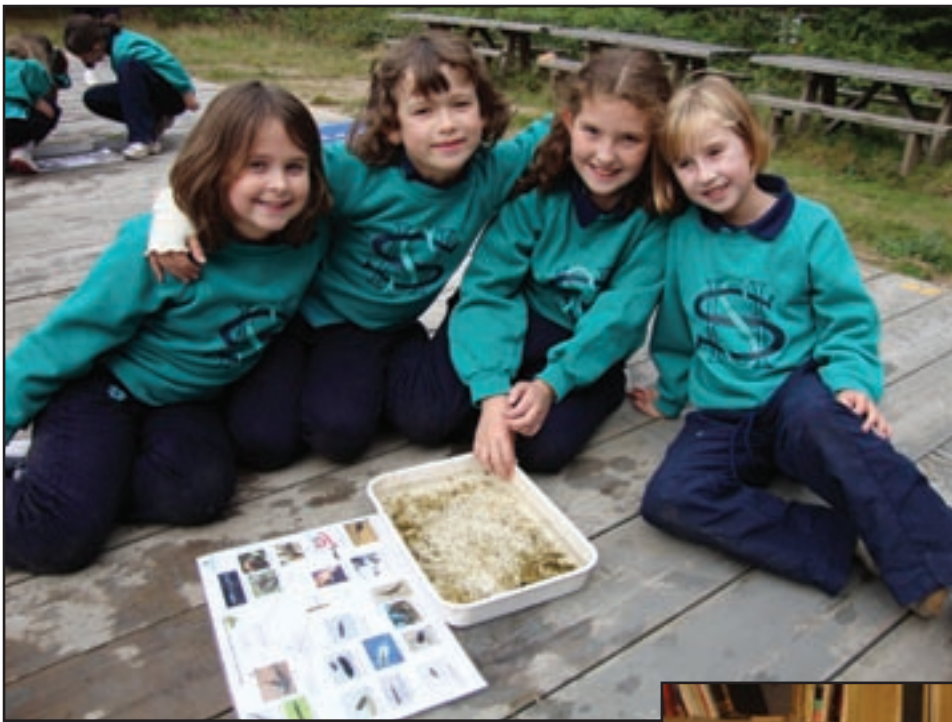
Finding out about habitats at Sherwood Pines, Y4s.