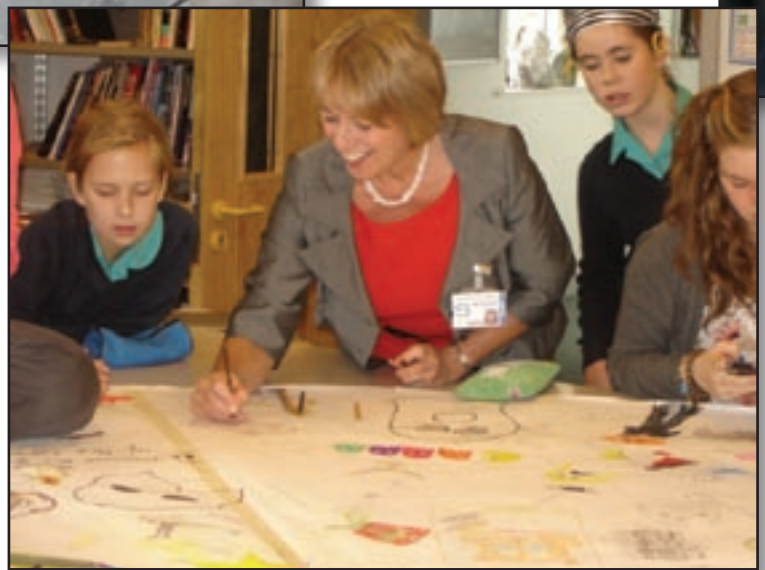
Drawing together every lunch time for a week to take part in this year's 'Big Draw', girls produced an elaborately decorated wigwam.