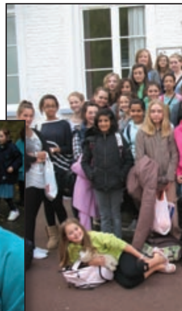
Spending a successful Year 9 girls practicing crêpes, visited a church and danced