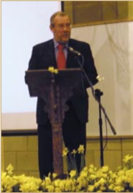
Richard Caborn speaking.

Friday 28th April saw the visit of rising star of the Liberal Democrat Party and newly elected Member of Parliament for Sheffield Hallam, Nick Clegg to Sheffield High School's prestigious sixth-form centre. In front of a packed audience of Sixth-Formers and year 11 girls he outlined his job as an MP focusing upon his criticisms of Charles Clarke, who at that stage was in the middle of the crisis in the Home Office. Nick Clegg had spent most of the week calling for Clarke's