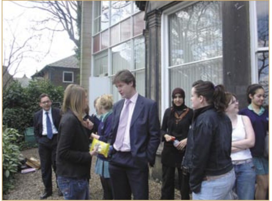
Nick Clegg at SHS.

resignation and a matter of hours after Mr Clegg's appearance at Sheffield High School, Clarke was to be sacked from his Cabinet job.